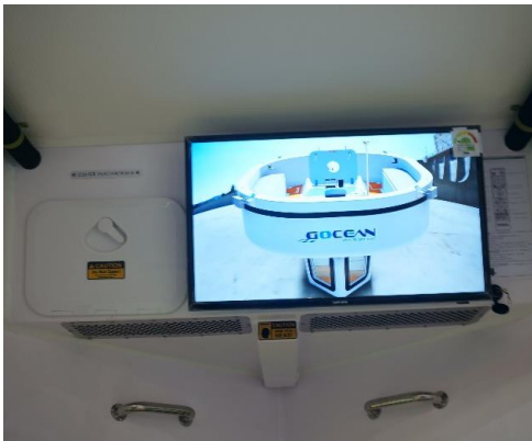
TV inside the cabin