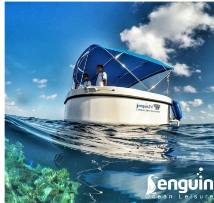
Side view in water